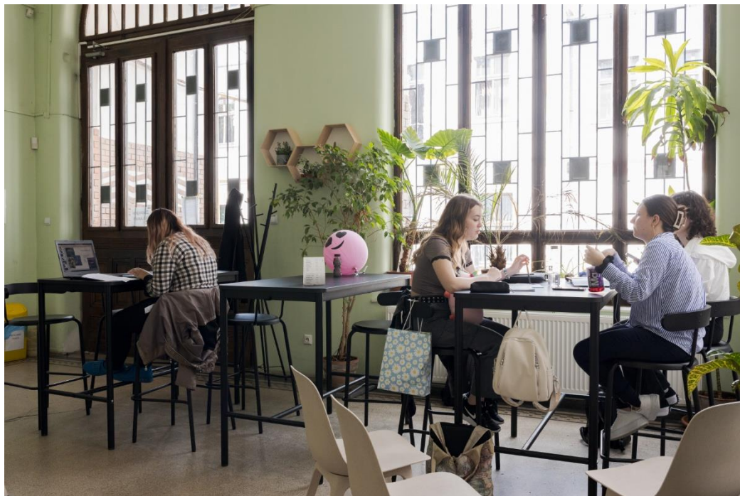
Science Café – the place where students can meet, work, relax between courses

We reject non-ethical behaviour, any type of discrimination, harassment, bullying. UBB adopted clear guidelines with regards to ethical behaviour , rejecting different forms of discrimination , promoting gender equality , and we are also signatories of the European research assessment reform, and members of CoARA . We promote gender equality, open science, constructive scientific debates and believe in collaboration as a motor of progress in science. The conference is intended to help early career researchers in networking, and generally to connect research groups for the benefit of scientific knowledge specifically concerning social insects.