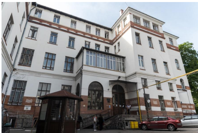
The campus of the Faculty of Biology and Geology

There are a lots of accommodation possibilities in and around Cluj. Hotels, hostels and pensions are everywhere, and they come in every shape and with very different prices. The middle of September should be ok, all the big festivals (Untold, Electric Castle, Jazz in the Park, Transylvania International Film Festival) are already over. For up to 15 participants we can offer accommodation in the Universitas Hotel of the UBB for 155 RON/night/person (circa 34 €). Breakfast is not included, it should be paid separately. Would you be interested, let us know in an e-mail. First come, first served.