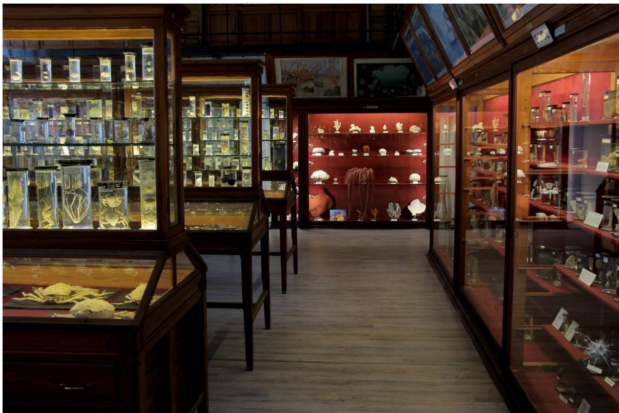
The Zoological Museum of the university in the campus of the Faculty of Biology and Geology.

If you wish to become member of the Central European Section of the International Union for the Study of Social Insects please consult the section's website .